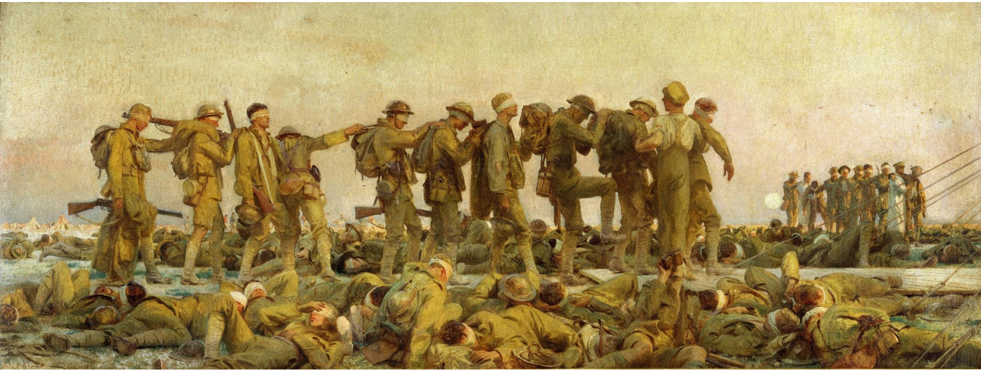
Gassed by John Singer Sargent