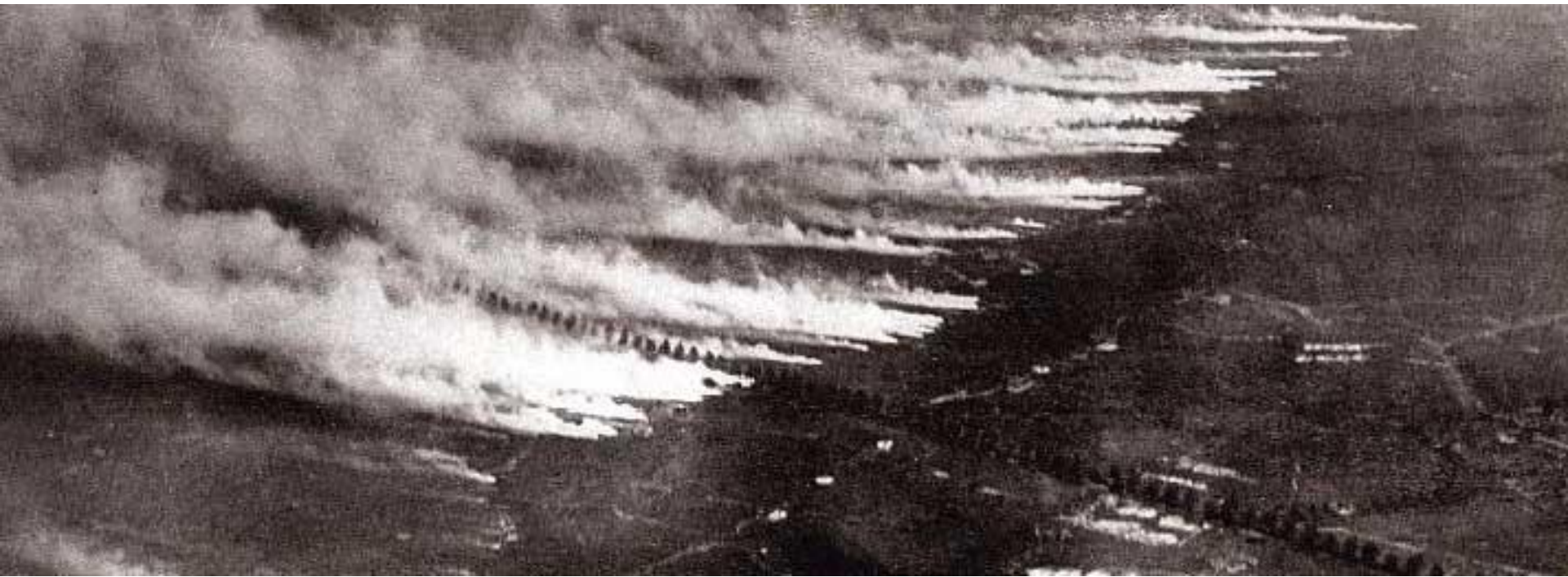
Chlorine gas released into the air during WWI