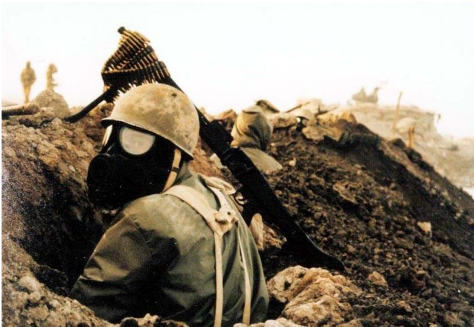
Chemical warfare during the Iran-Iraq War